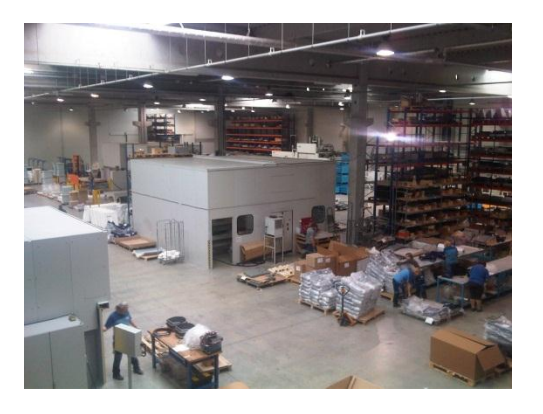
The Brno manufacturing facility in 2012.

Seaborne produced components grace Harrier jets, Virgin trains and some of the worlds best known high performance cars as well as equipment used in hospitals around the World. Our work in architectural lighting is considered the finest of its type and we continue to produce exceptional results with an engineer's eye for detail.